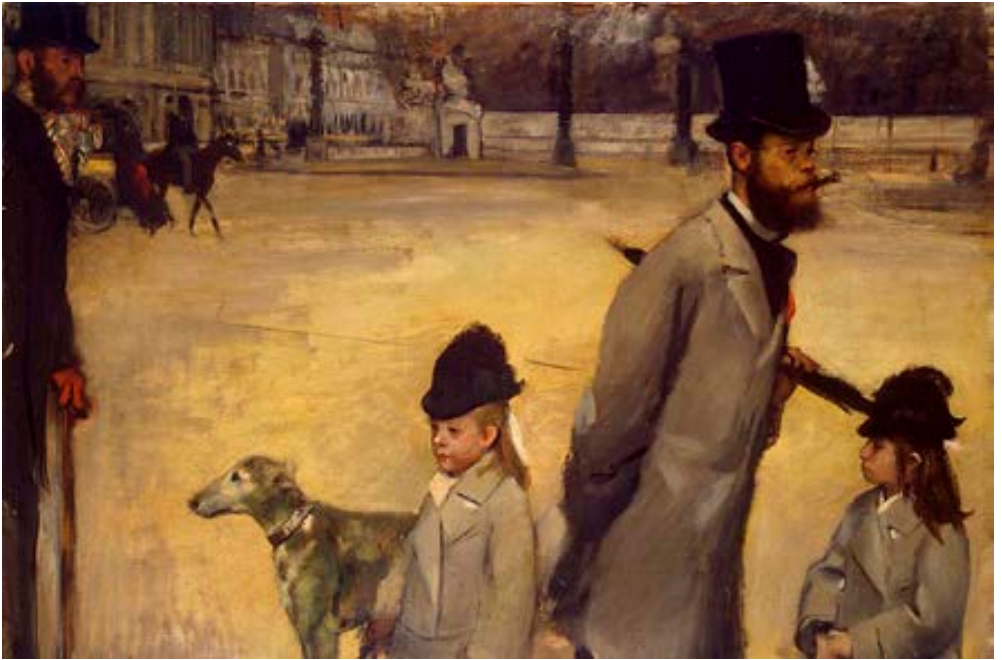
3 Edgar Degas: »Place de la Concorde (Vicomte Lepic and his Daughters)«, 1875, canvas, 78,4 cm x 117,5 cm. Previously in the Gerstenberg Collection, Berlin; currently in the Hermitage, St. Petersburg