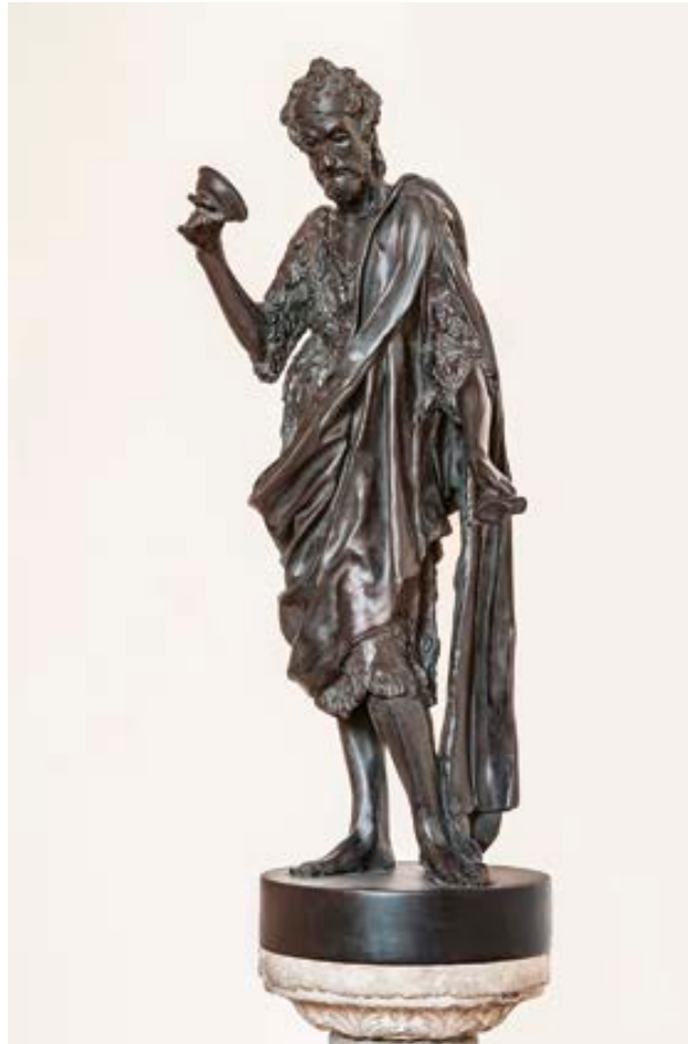
4 Modern plaster cast of Donatello's »John the Baptist« (1420s/1430s, bronze, originally 84 cm high) in the exhibition »The Lost Museum« (Bode-Museum, 2015). The original sculpture today is in the Pushkin Museum, Moscow (Inv. 3C-8).

Its stated aim is to research, restore, publish, and exhibit works of art once in Berlin and now in Moscow, so that they can once again be the object of enjoyment by the art-loving public and the focus of scholarly debate. Marina Loshak also introduced Vasily Rastorguev as the designated curator of sculpture – he had seen »The Lost Museum« in Berlin beforehand and knew our approach and convictions, which he shared. It is on this memorable occasion that, for the first