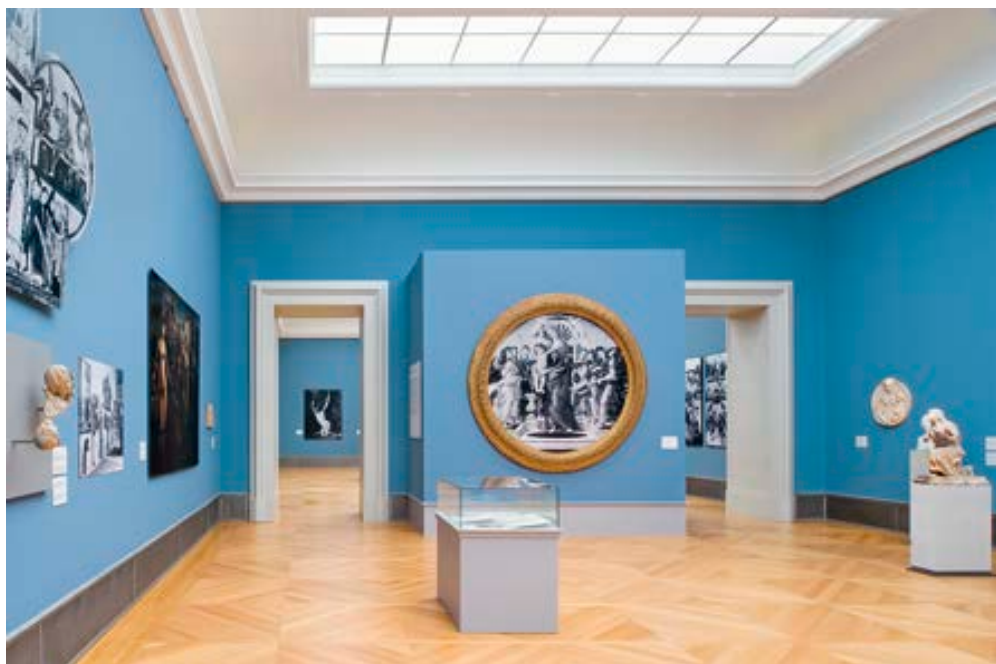
1 View into the exhibition »The Lost Museum. The Berlin Sculpture and Paintings Collections 70 Years after World War II« (Berlin, Bode-Museum, 19 March to 27 September 2015)